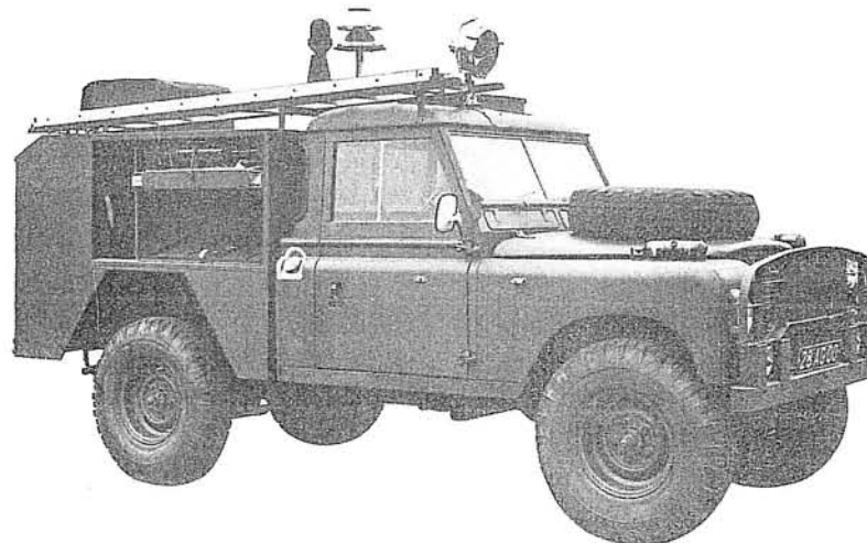
Fig.1. Truck airfield crash rescue - R.H. side